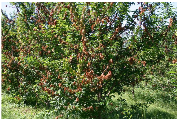
Figure 1. Blueberry plant with 50% of branches infected with Phomopsis canker.

Samples were kept on ice in a cooler and brought back to the lab. A total of 150 twig and branch samples were incubated in moist chambers and the resulting fungal fruiting bodies were