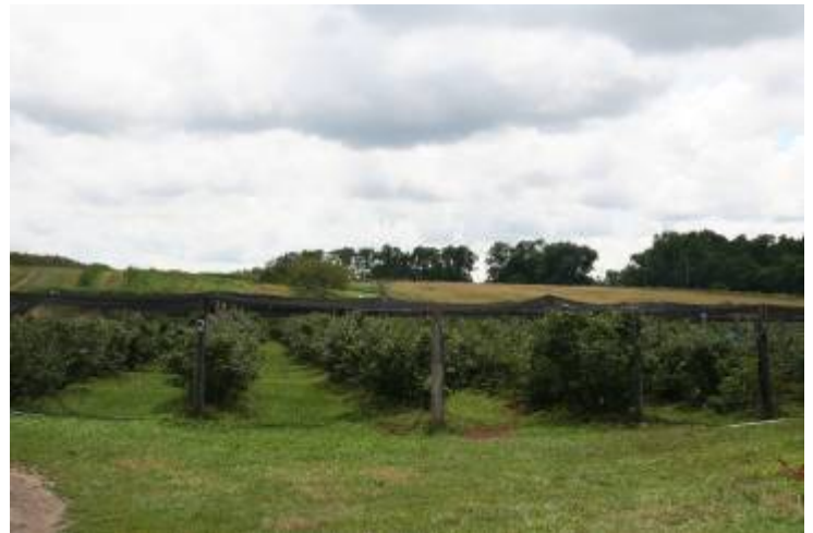
Bird netting on a mature blueberry planting in Chautauqua County

Many NYS growers surveyed consider the proximity to convenient perches as the most important bird consideration made prior to planting. Fields that are bordered by woods or power lines or are adjacent to abandoned fields are more susceptible to bird damage. One grower reported that removing all high landing areas worked well as a bird management technique and another grower mentioned that planting too close to the forest or hedge row was most likely his biggest mistake in terms of bird control. The proper site may also explain why the second highest number of survey respondents reported that they have no bird management practice in place. The other explanation for these responses may be that these growers are not aware of the extent of their crop loss