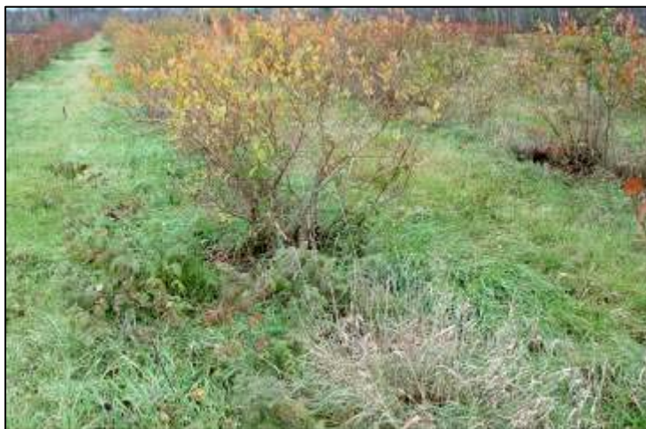
Blueberry planting where weeds have gotten ahead of the game, photo by L. McDermott.

NYS blueberry growers use a variety of techniques to manage weeds after planting. The perennial nature of this berry crop makes weed management a constant challenge; not any one technique will do the trick. The majority of growers used herbicides and mulch as their first line of defense, coupled with hand weeding and mowing to a lesser degree. Most herbicide applications are done in spring (pre-emergent) when weeds are just starting to push, but berry bushes are dormant. Late/spring summer weed control consists mostly of spot applications and hand-weeding. Growers advocated sod alleyways and planting edges be routinely mowed to reduce weed seed re-entrance. Fall clean up applications are used to catch any weeds escaping earlier efforts. Some growers felt weed block or landscape fabric use under the mulch gave added weed control benefit.