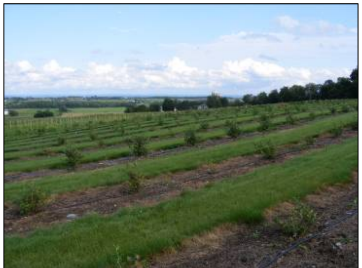
New blueberry planting on the Tug Hill, photo L. McDermott.

Selection of sites that are favorable for blueberry culture is the first step in getting a blueberry planting established. All were quick to admit that proper pH was absolutely critical to good plant establishment. This begins with preplant soil testing and soil amendment. Higher pH soils with calcium levels of 2000 or more, while excellent for other berry crops, are not appropriate for blueberries. Extensive annual soil amendment of such soils may bring pH levels down but it's a painfully slow and often expensive process. Even when pH levels begin to approach the desirable range (4.5 to 5.0) soil amendment on these types of soils must continue; high soil calcium continually neutralizes acidifying agents. Meanwhile, young plants on these soils struggle to get established under less than optimal growth conditions. If possible, select other sites on farm with soil properties closer to those desirable for blueberries. Other things to consider when selecting a planting site are exposure (frost pockets, open windy areas, areas with poor air drainage), soil drainage, and accessibility.