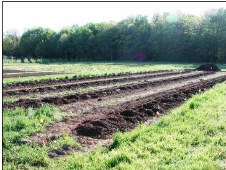
Bed preparation for blueberry planting, Geneva, NY

Preplant soil amendments (fertilizers, acidifying agents, and supplemental organic matter) should be incorporated into the top 8 inches of soil at least 1 year prior to planting.